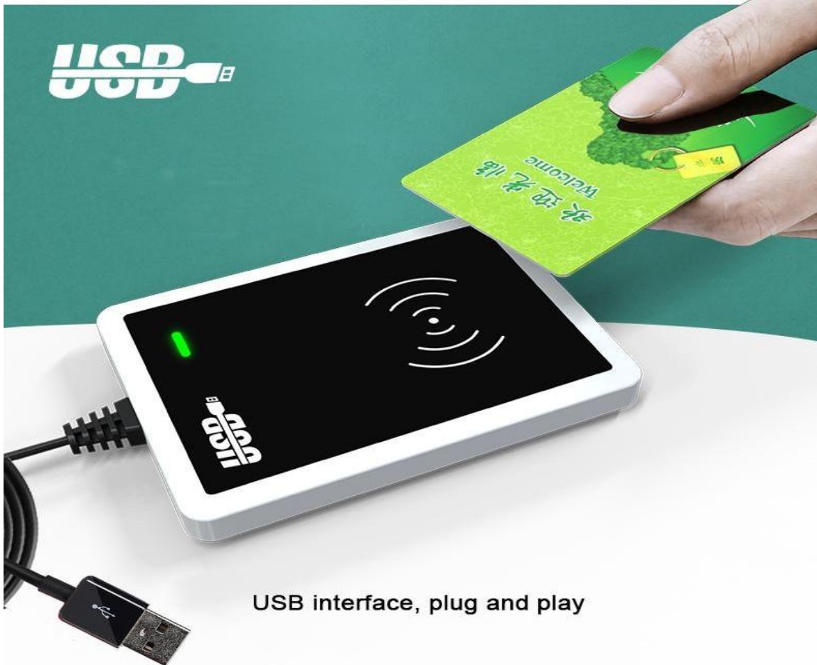
USB interface, plug and play