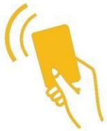
Access Control System

tripod turnstiles represent classic and safe way to protect your premises. They are widely used in various indoor environment applications. They fit perfectly as an economical option into the office buildings and other related applications.